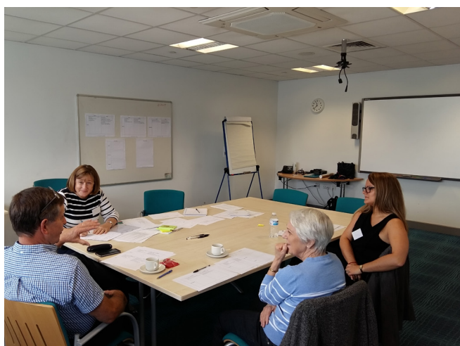
Workshop participants discussing about their experience

Thanks again, we could not do it without your input!