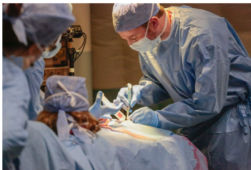
Simulated neurosurgery at the Big Bang festival

www.markwilson.com/Teach_Yourself_Neurosurgery.html